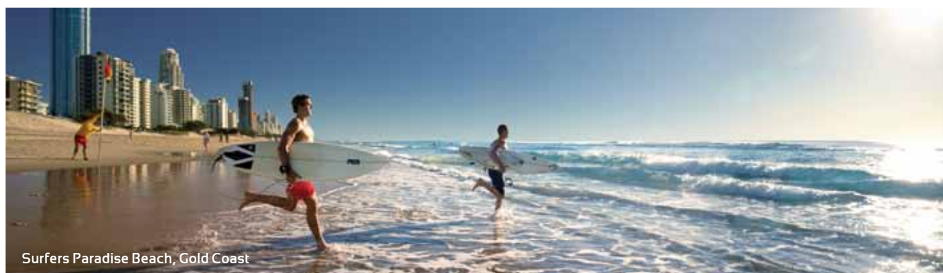
Surfers Paradise Beach, Gold Coast

These projections will be reviewed on a regular basis to ensure changes to frequency and capacity over time and the addition of new routes are accounted for.