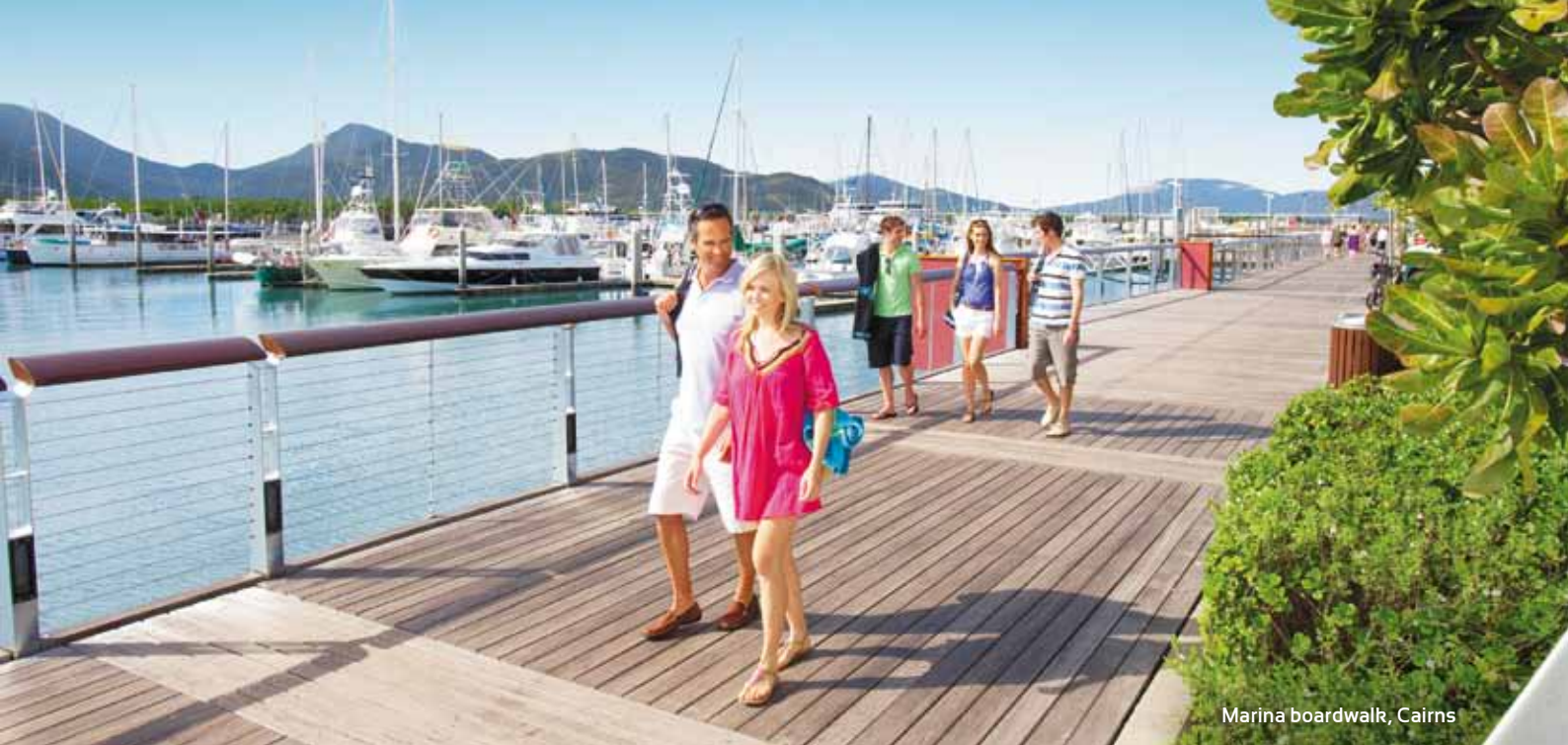
Marina boardwalk, Cairns