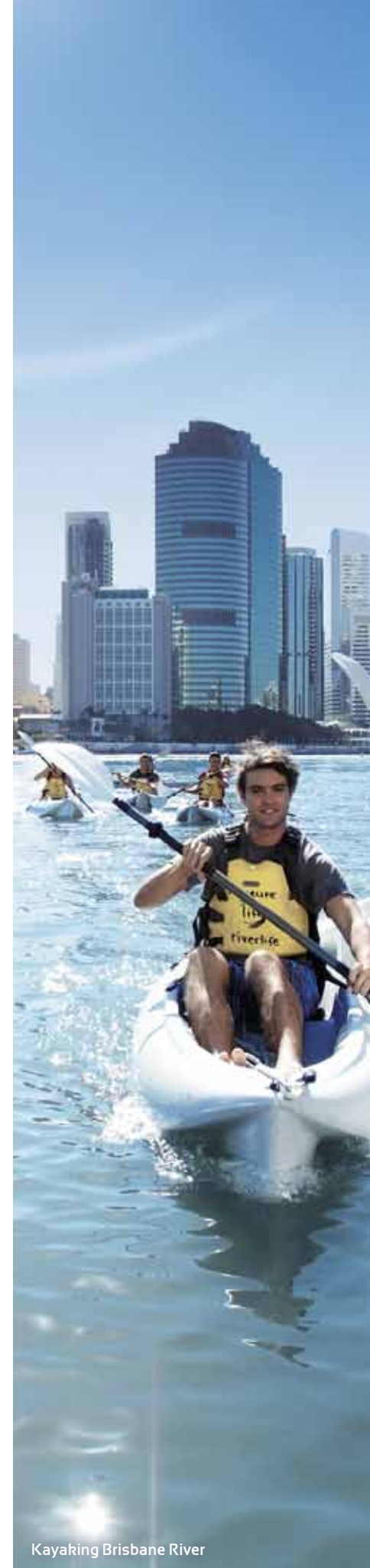
Kayaking Brisbane River