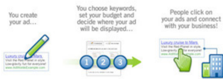
Screen capture copyright: Google

Google is the most widely used search engine in Australia. It is therefore recommended that you use Google’s pay per click program (AdWords) if you are a beginner in the PPC field. We will use Google AdWords as an example. However, the same principles apply to other search engines offering Pay Per Click.