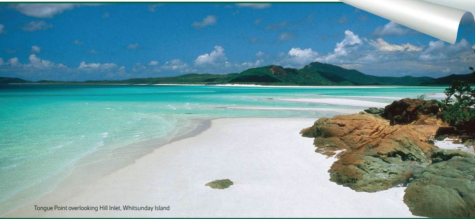
Tongue Point overlooking Hill Inlet, Whitsunday Island

Few natural wonders command such attention as the Great Barrier Reef, the world's greatest coral reef system. Those who see it never forget it. Here, after all, is a spectacle so vast that it can be seen from the moon.