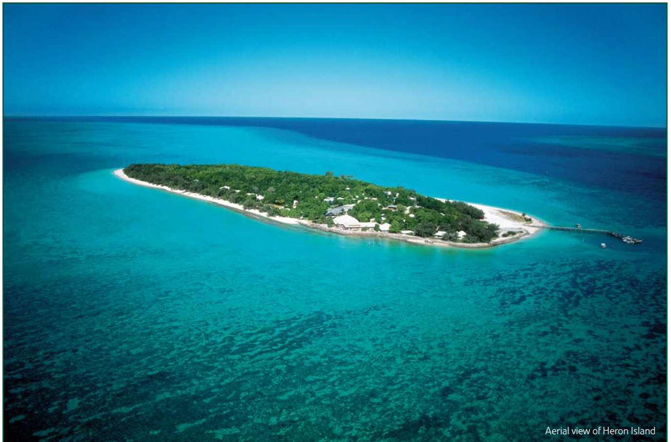
Aerial view of Heron Island

telephones, televisions, daytrippers or children under 15, Orpheus provides the ultimate hideaway. The waters off the island are home to a vast array of vibrant, coloured marine life, showcasing 1,100 species of fish and 340 of the 350 known species of reef coral.