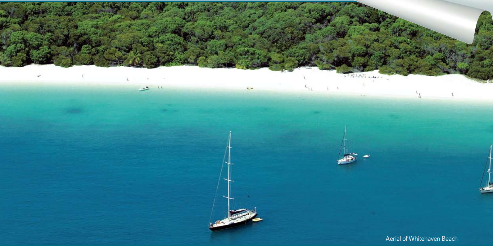
Aerial of Whitehaven Beach

In the heart of the Great Barrier Reef lie the Whitsundays – 74 islands floating like jewels in the warm tropical waters of the Coral Sea. Only eight are home to secluded resorts, the rest are untouched hideaways of white sand and lush greenery.