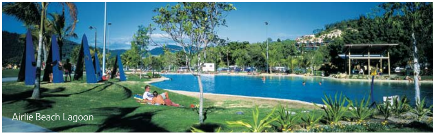
Airlie Beach Lagoon