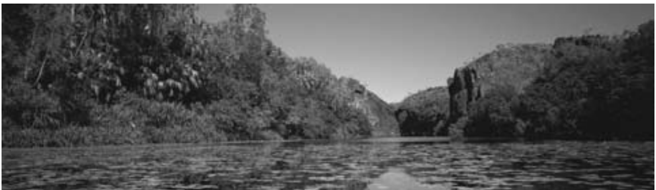
Lawn Hill Gorge, Lawn Hill National Park

(Included Meals: Breakfast; Lunch; Dinner)