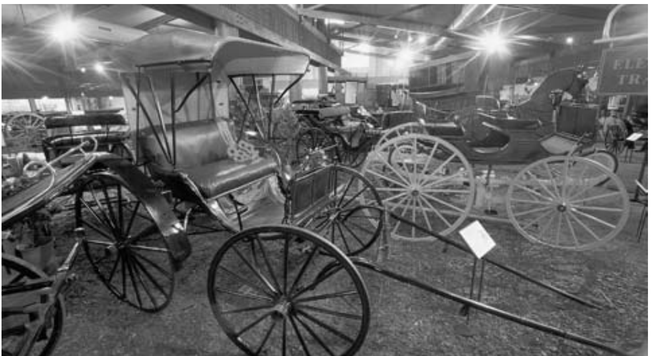
Cobb & Co. Museum, Toowoomba

Afternoon / Evening We leave Toowoomba and make our way back to Brisbane. We should arrive in Brisbane at approximately 6.30pm.