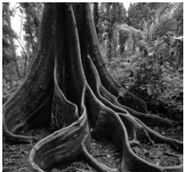
Nandroya Falls Tree, Wooroonooran National Park.