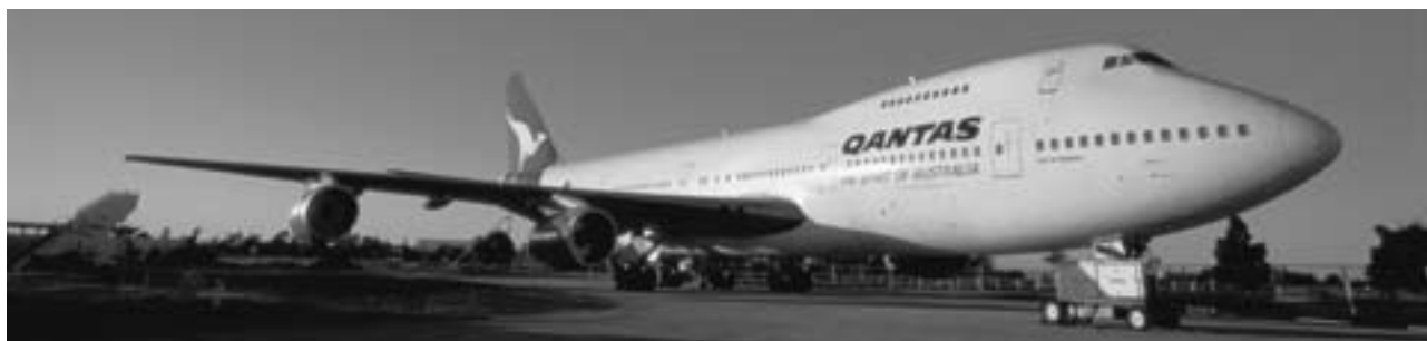
Qantas Founders Museum, Longreach

Our campsite: Major Mitchell Caravan Park, Warrego Highway, Mitchell. Ph: (07) 4623 8177 (Included Meals: Morning Tea; Lunch; Dinner)