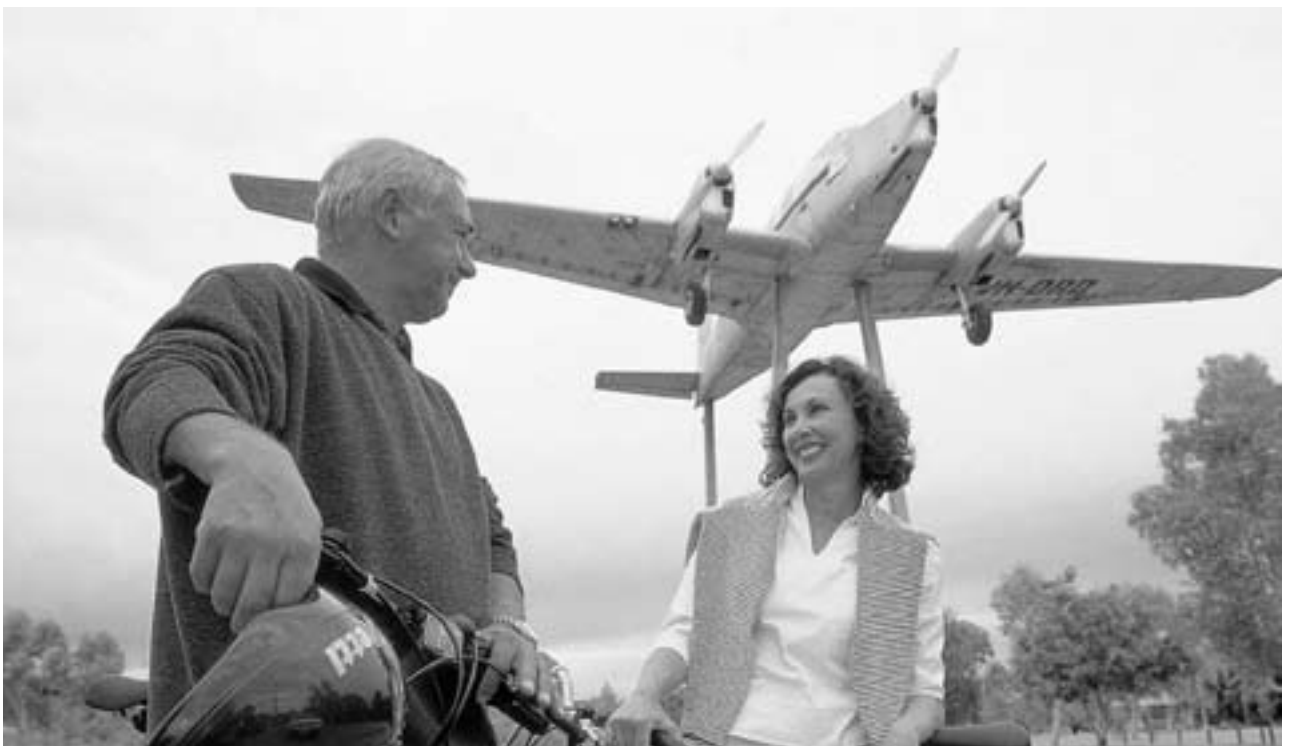
Royal Flying Doctor Service Visitor Centre, Mount Isa

(Included Meals: Breakfast; Lunch; Dinner)