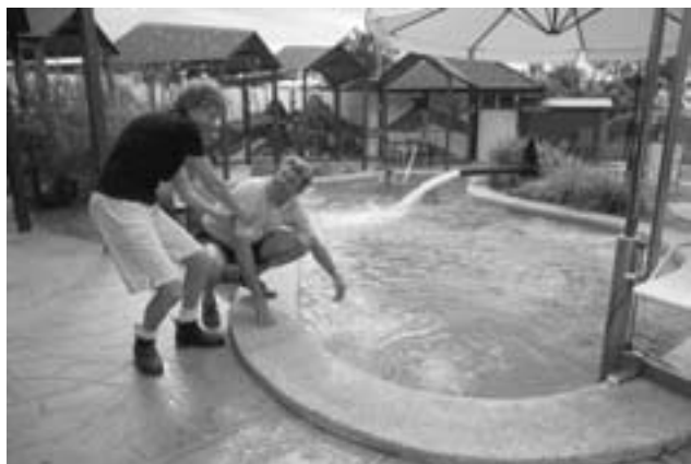
Great Artesian Spa.

(Included Meals: Morning Tea; Lunch; Dinner)