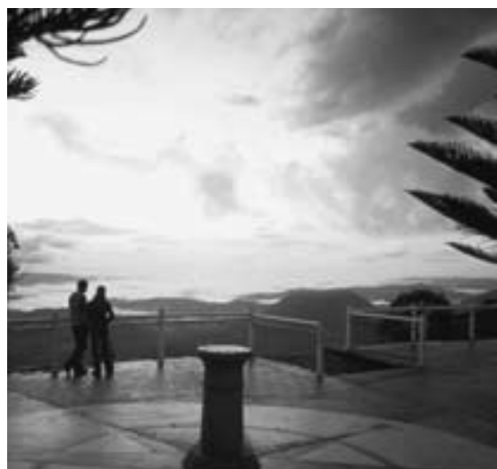
Picnic Point, Toowoomba

(Included Meals: Morning Tea; Lunch; Dinner)