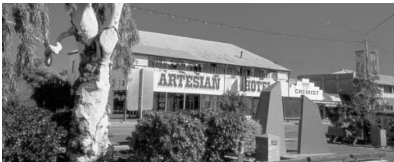
Tree of Knowledge, Barcaldine

(Included meals: Breakfast; Morning Tea; Lunch; Dinner)