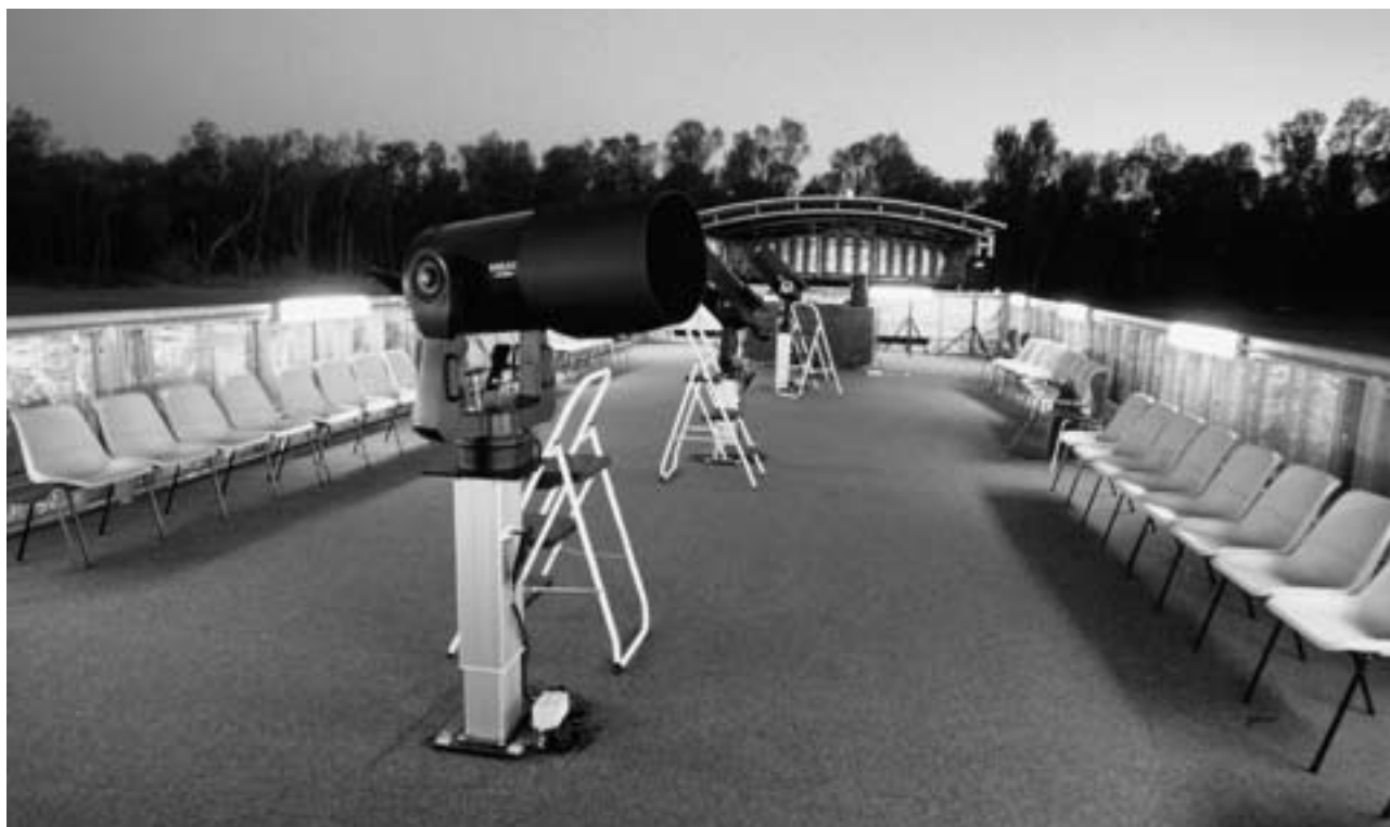
Cosmos Centre, Charleville

(Included Meals: Morning Tea; Lunch; Dinner)