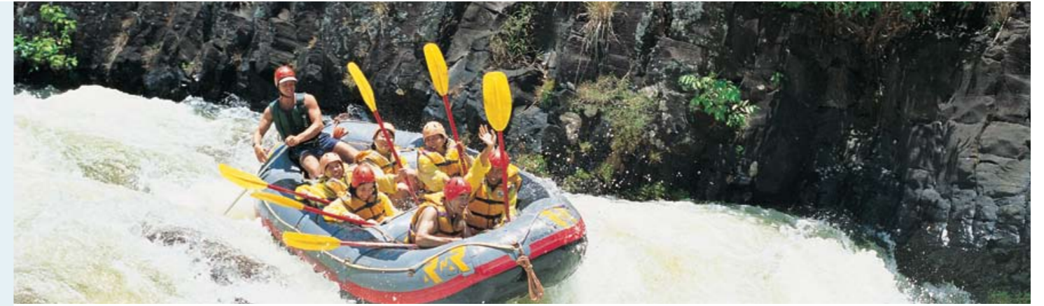
White Water Rafting on Tully River