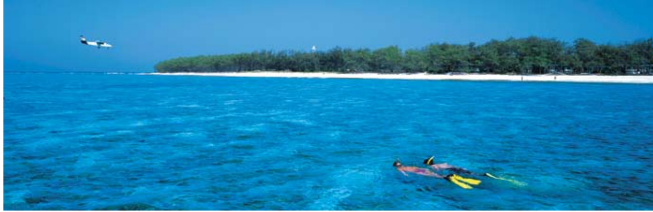
Snorkelling, Lady Elliot Island