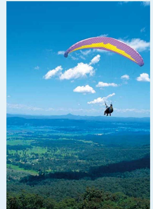
Para Gliding, Mt Tamborine

Domestically, Queensland received approximately 2.8million travellers participating in adventure activities in the year ended December 2006 (23% of all domestic adventure travellers in Australia).