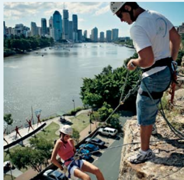
Abselling at Kangaroo Point Cliffs, Brisbane

All actions can be viewed in the full version of the Adventure Tourism Action Plan, available at www.tq.com.au .